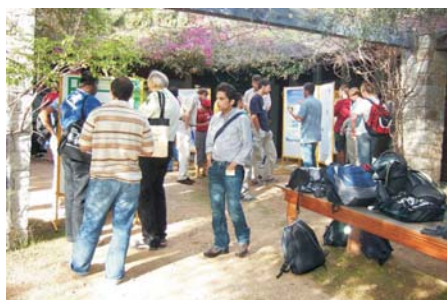
Fresh-air poster session